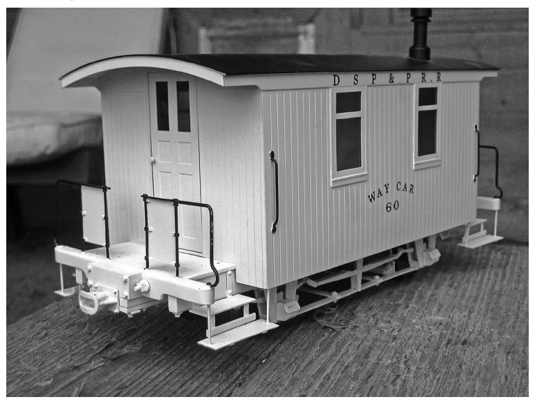
Builder's photo end view of Accucraft waycar showing solid panels in end rails and side window treatment.

To end your DSP&P freight train accurately, you can also consider the Hartford Products kit for DSP&P Waycar No. 72, available from Ozark Miniatures website. I have two of them, built by others, as my eyesight is now well below what is needed for craftsman kit construction. Happy Modeling!