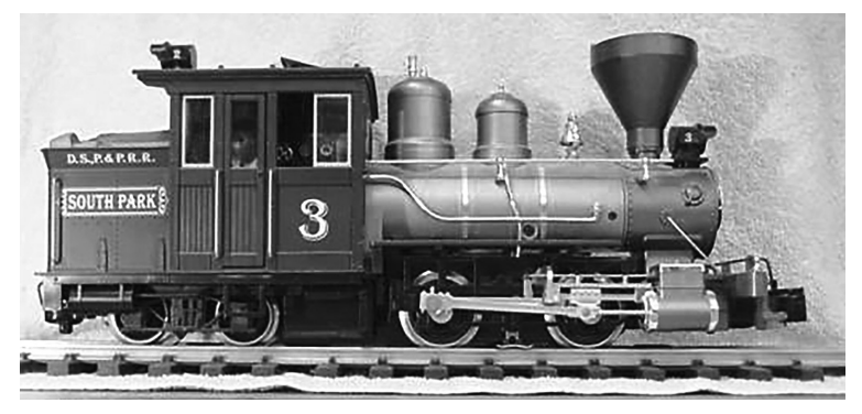
Builder's photo of DSP&P No. 3, LGB's pseudo-Mason Bogie.

The price was right and nothing else resembling a real Mason Bogie was available at the time, so this model, with new headlights, passed for my first Bogie, renumbered to DSP&P No. 3 – at least the number, if nothing else, is correct.