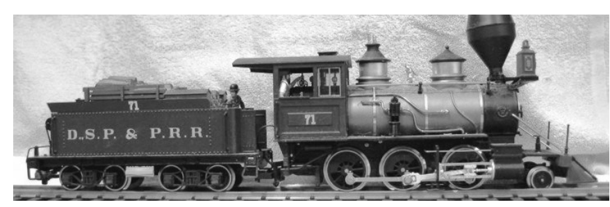
Builder's photo of DSP&P #71, photo by the author