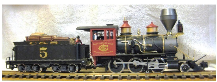
Builders photo of C&S #5, photo by the author.

tail), and a wood load in the tender, even though these locomotives never burned wood. After this, LGB produced many versions of their Mogul, including 6 of the 7 modernized C&S Cooke Moguls (#6 through 10), with simulated steel cabs, smooth domes, straight stacks, and coal in the tender. Some had bear trap spark arrestors or snowplows. An ornate old-time version was produced as C&S #5.