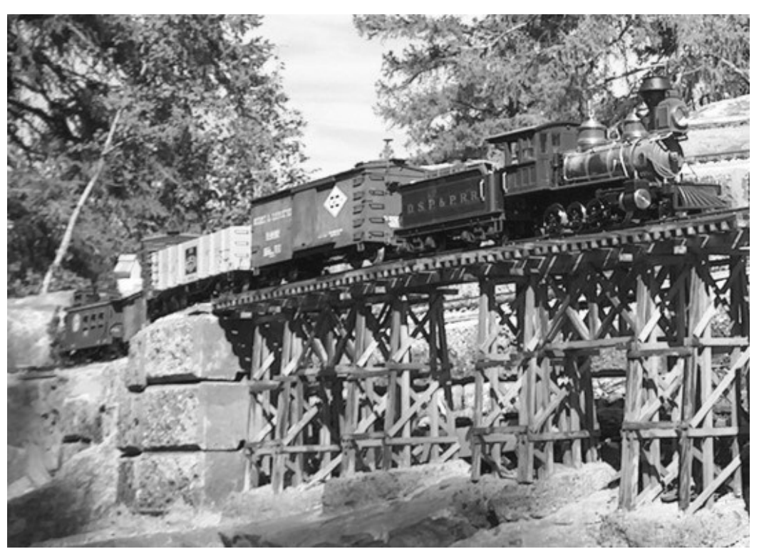
Delton Classic DSP&P 2-9-0 on the author's outdoor railway