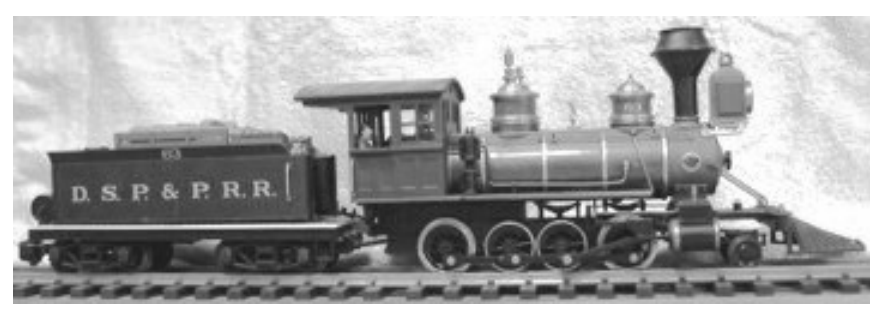
Builder's photo of DSP&P #63

In 1989, Delton Locomotive Works began producing a D&RW C-16 Class 2-8-0, in 1:24 "H" scale. The good-looking body was plastic with some metal fittings, and a good metal frame and metal wheels. The motor and gearbox were a little primitive and it took 6 more years before all the mechanical issues were resolved. It was painted in several variations for the Colorado and Southern, but none were sold labeled for DSP&P, although a paint sample was prepared and advertised.