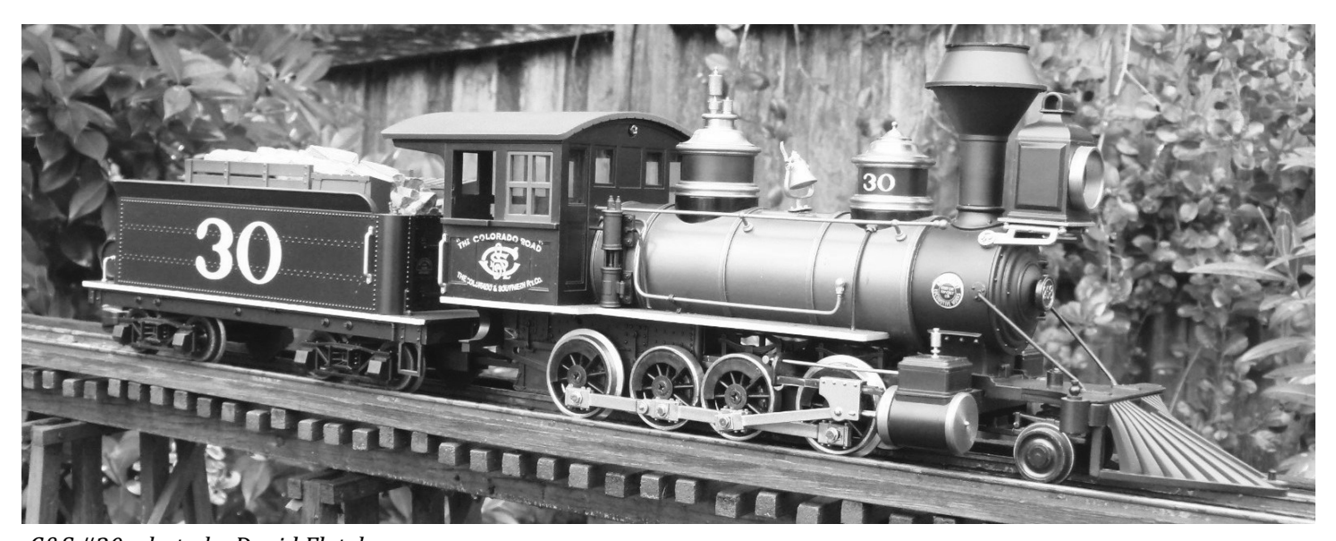
C&S #30