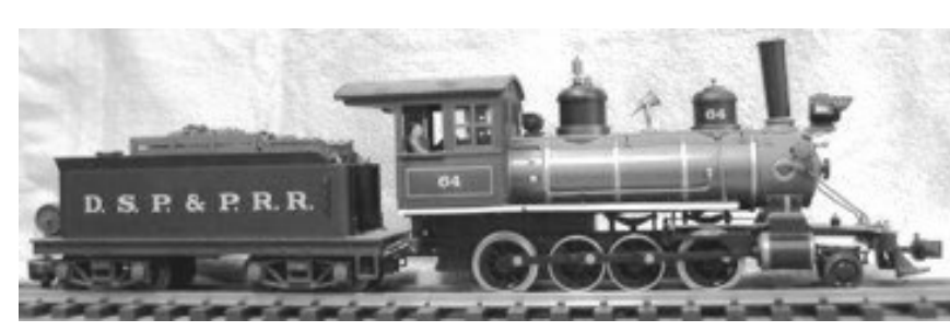
Builder's photo of DSP&P #64