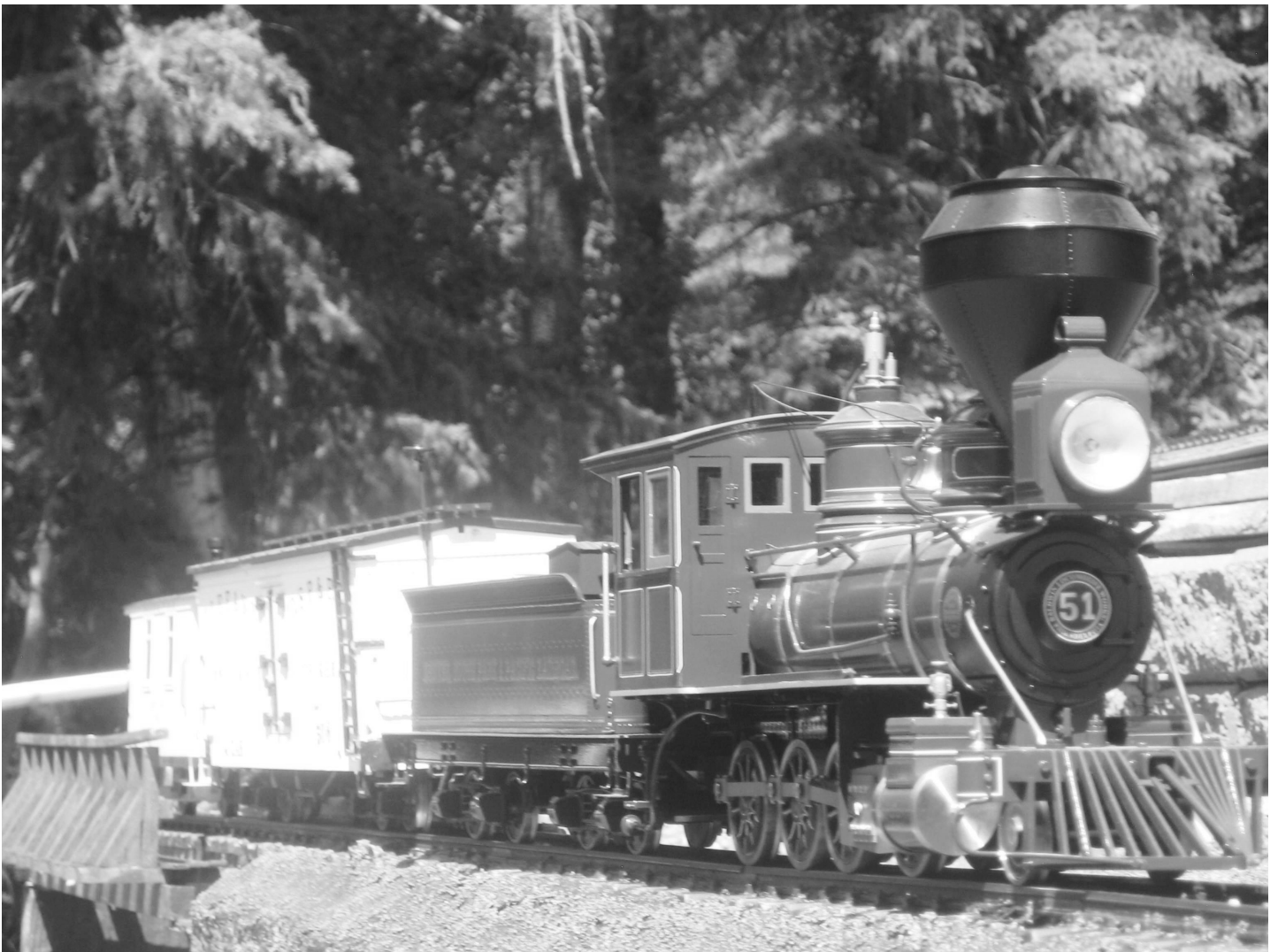
DSP&P #51 on the author's outdoor railway