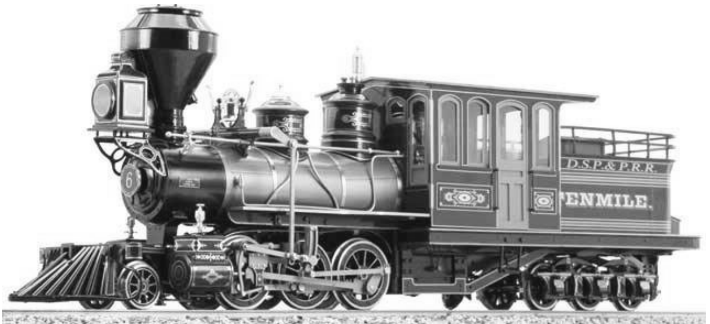
Builder's photo of DSP&P #6

The models come in two liveries: a dark green version of DSP&P #4 "San Juan" and a chocolate brown DSP&P #6 "Tenmile". Both have simulated Russia Iron boilers and simulated ash or oak cabs with the exquisite arched win-