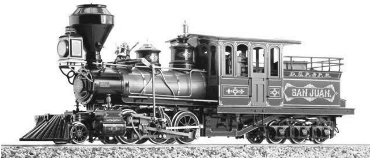
Builder's photo of DSP&P #4 "San Juan"

Advertised in 2007, the first prototype of Accucraft's 2-6-6T Mason Bogie, in 1:20.3 "F" scale, made an appearance online in the summer of 2009, with deliveries to customers occurring in late 2010. The models were patterned after builder's photos and plans of the early "light" DSP&P Mason-built locomotives. This double truck design won the