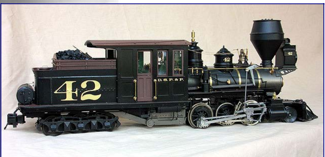
#42 Paint scheme, taken from 1885 Union Pacific Specs, as provided by Jim Wilke. The decals were designed and produced by Stan Cedarleaf.

Check out these 2 movie clips of the vavle gear in motion, [ movie clip #1 ] - [ movie clip #2 ]