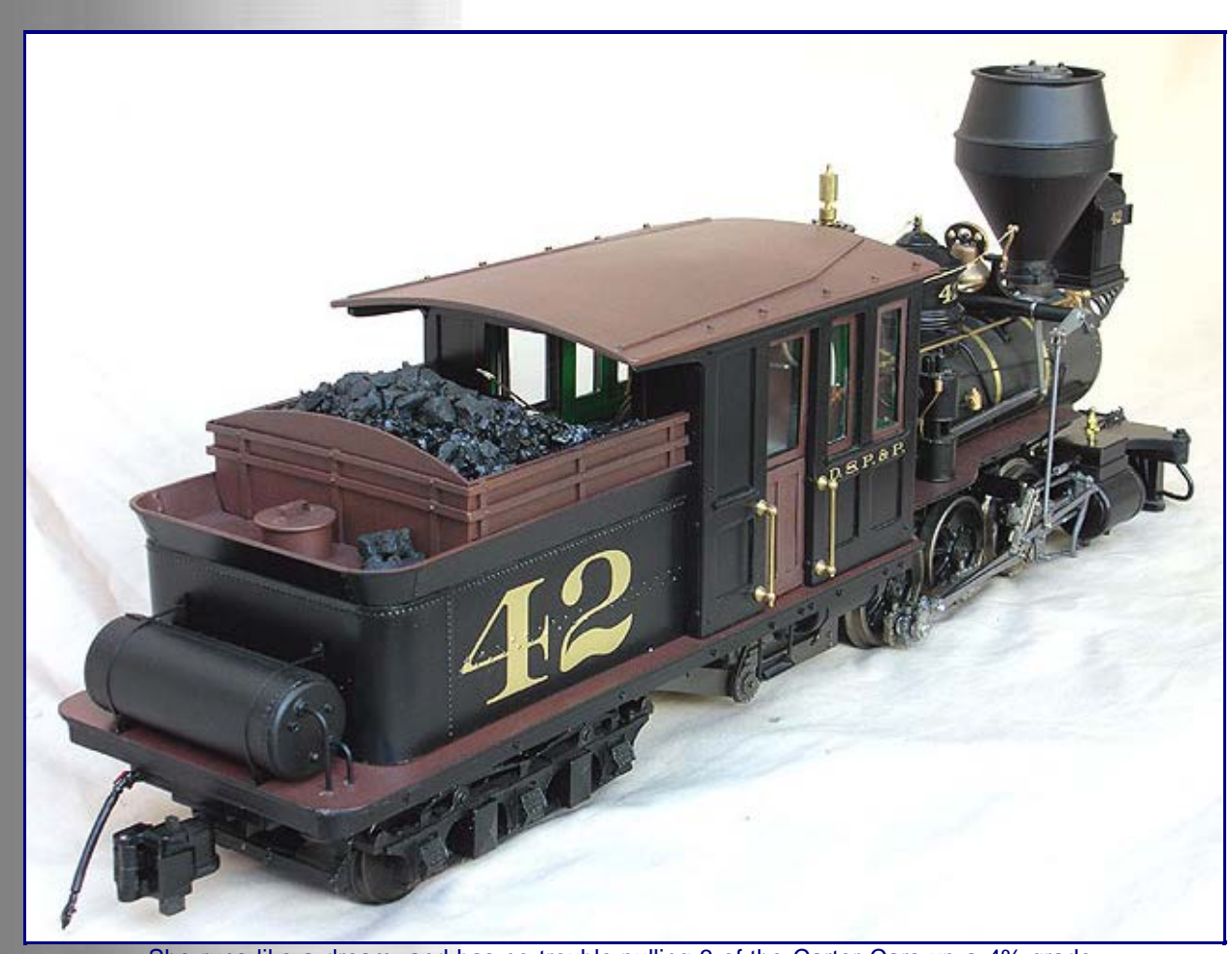
She runs like a dream, and has no trouble pulling 3 of the Carter Cars up a 4% grade.