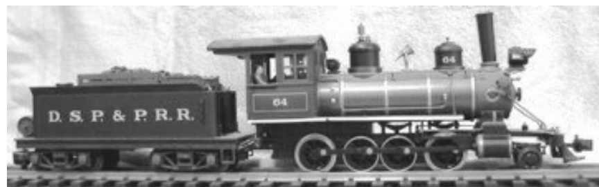
Builder's photo of DSP&P #64