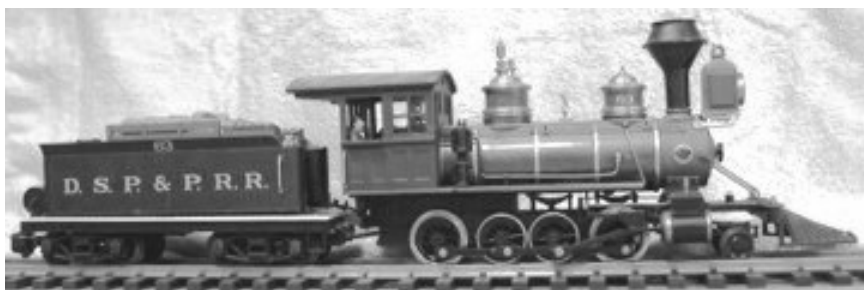
Builder's photo of DSP&P #63