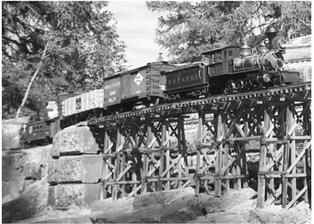
Delton Classic DSP&P 2-9-0 on the author's outdoor railway