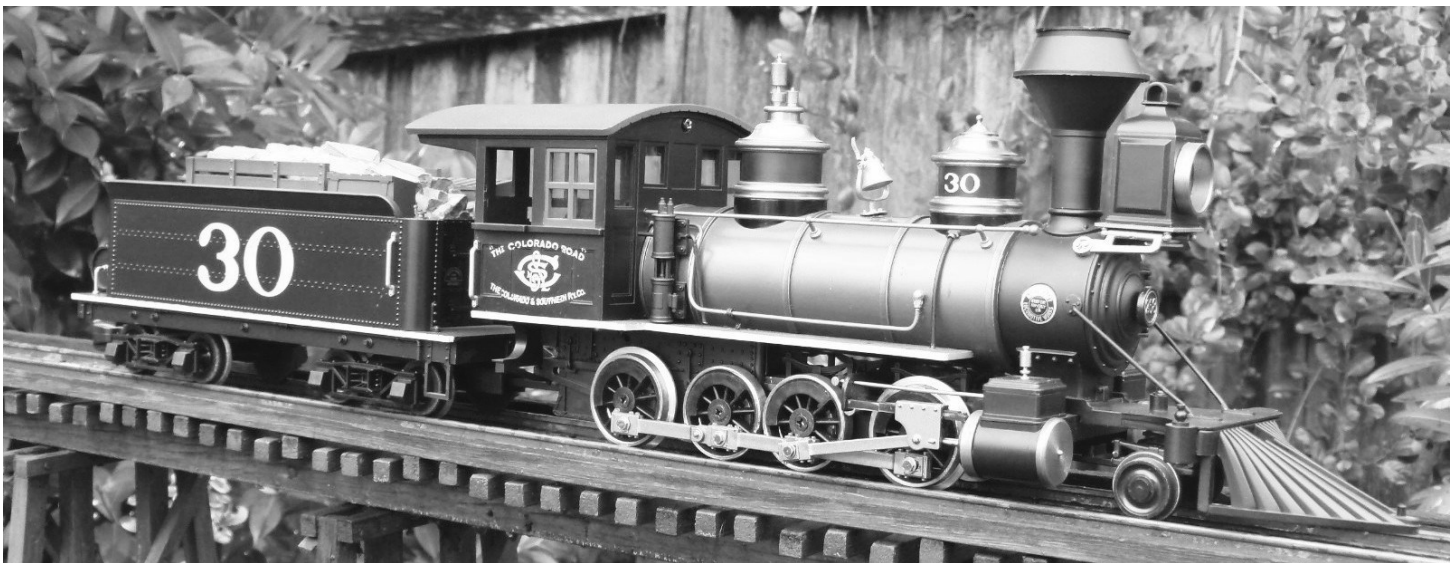
C&S #30