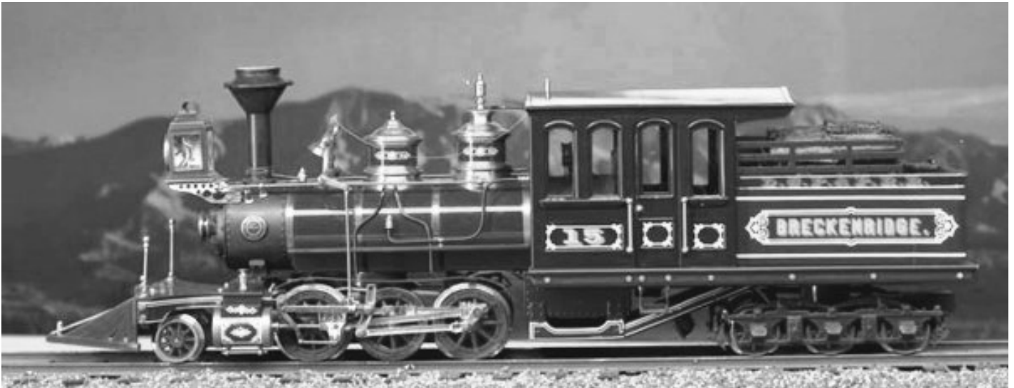
Builder's photo of DSP&P #15 "Breckenridge"

Delton Locomotive Works (DLW) of Delton, Michigan produced the first large scale brass models of DSP&P 2-6-6T Mason Bogies, in 1:24 "H" scale, in 1983-84. The models were patterned after DSP&P #15 "Breckenridge", the best known of the 14 "light" double truck locomotives that Mason Machine Works delivered to the DSP&P in 1879.