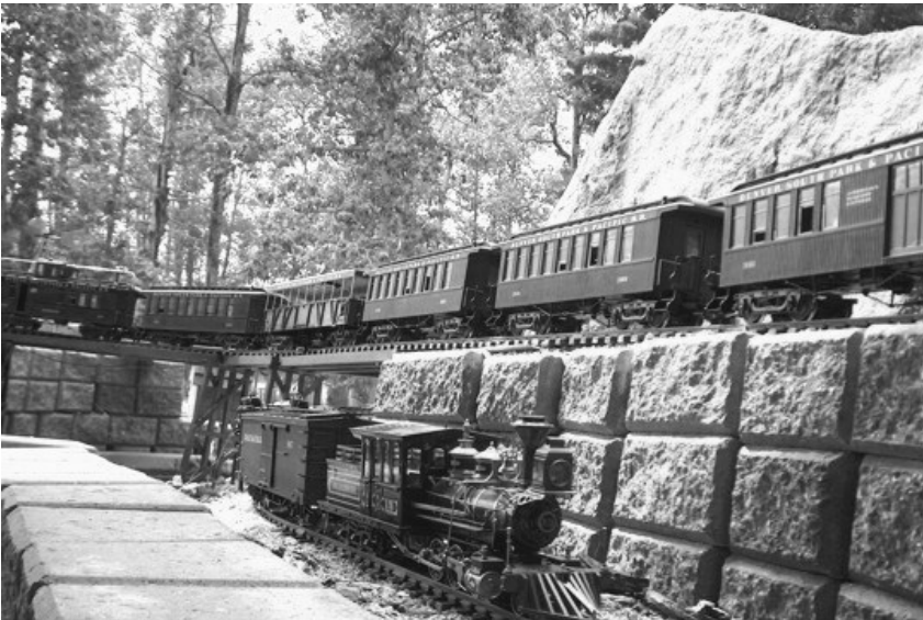
Delton DSP&P #15 on the author's outdoor railway.